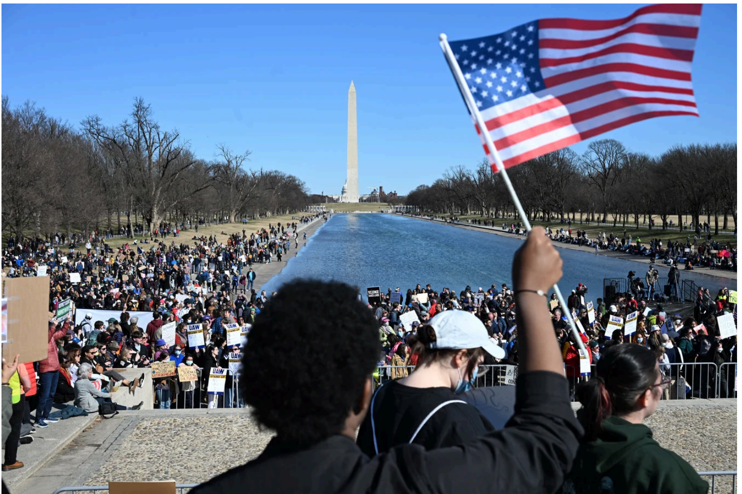
Demonstrators take part in a "Stand Up For Science" rally at the Lincoln Memorial in Washington, DC, on March 7, 2025.